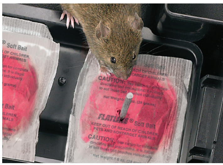
Pouches can be quickly secured with bait rods or feeding devices