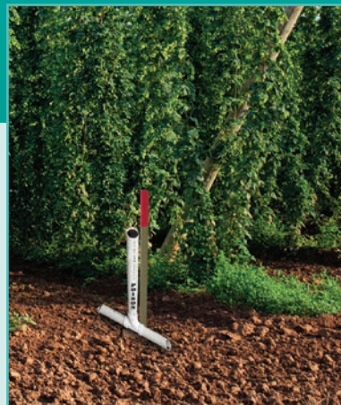
Bait stations are an effective baiting tool on border areas / buffer strips