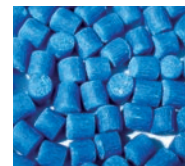
Wet Process Mfg'd.***

No dust & consistent size*** enables consistent flow, reduced “clogs” & waste and easy equipment clean-up.