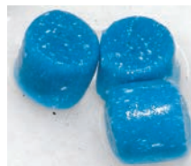
Elapsed time: 24 hours Conditions: Open Petri dish, 20mL water