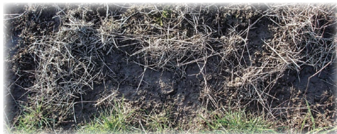
Stand loss from slug feeding