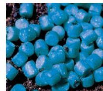
Elapsed time: 16 days, Rainfall 1.6” Glenn Fisher Oregon State Univ., Corvallis