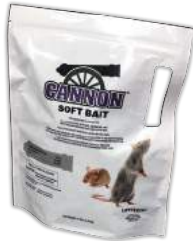
Available in 4 lb. bags