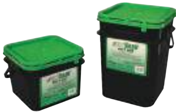
8 lb. pail