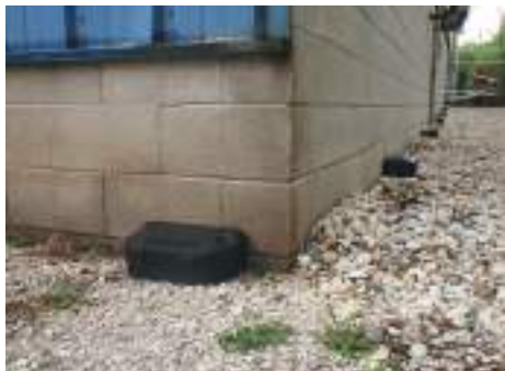
Remove all debris and thick vegetation adjacent to buildings. A 3 foot rock perimeter prevents harborage of rodents and foundation burrowing