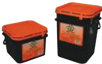
8 lb. pail