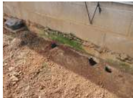
Place AEGIS® bait stations stocked with fresh rodenticide near burrows, damaged curtains, runways or other signs of activity