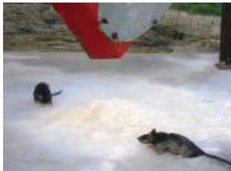
Remove feed and water sources that keep rodent populations alive