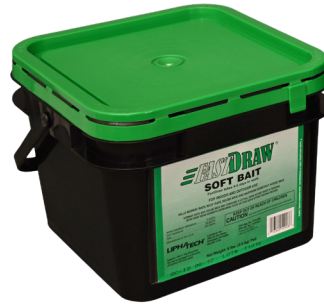
8 lb. Pail