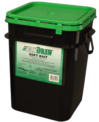
16 lb. Pail

Control Rodents • Lower Feed Costs & Contamination • Reduce Building Damage